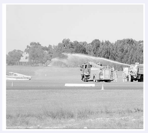
MFS and CFS crews attend to the crashed plane during an exercise at the Mount Gambier Airport.

Ambulance officers attended to the passengers, while MFS and CFS crews battled the blaze.